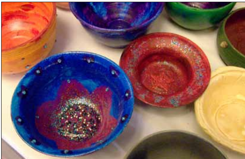
“Empty Bowls” were created by local student artisans to raise awareness of hunger in the community.

Update your AC account with any new contact information, new associates, new web links that may have changed in 2010. Just send an email to info@fdlac.com with your changes.