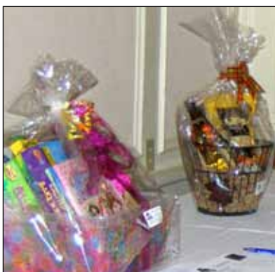
A Silent Auction with baskets of goodies helped to raise additional funds at the Empty Bowls event.

Event hosts were alumni from Leadership Fond du Lac, a nine-month program of the Fond du Lac Area Association of Commerce. The program was created in 1998 to provide information and experience to individuals who are willing to commit to serving their community. Participants in the program learn about local institutions and issues, and are challenged to put their skills and knowledge to use by developing a small-group community project. Results of past Leadership Fond du Lac community projects include the barrier-free playground, the Fond du Lac Dog Park and the ADA accessible boat ramp. Tuition assistance for Leadership Fond du Lac applicants in need is graciously provided by grants from the Fond du Lac Area Foundation.