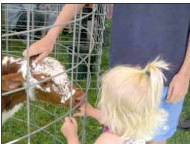
The petting zoo always attracts attention at Breakfast on the Farm.