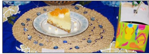
The Mandarin Orange White Chocolate Cheesecake, above, won first place. People's Choice winner, for best display, went to the Chocolate Irish Cream Cheesecake, right.

Thank you to exhibitors, donors, supporters, and countless volunteers of the Agriculture Showcase.