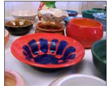
Variety was the rule of the day.

The event, organized and hosted by the Leadership Fond du Lac Alumni Group, brought community members, businesses and school districts together for a great cause. Art classes from Campbellsport High School, Fond du Lac High School, Horace